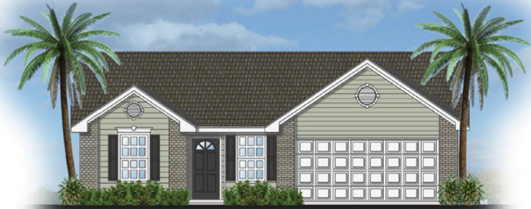
Shown with optional brick