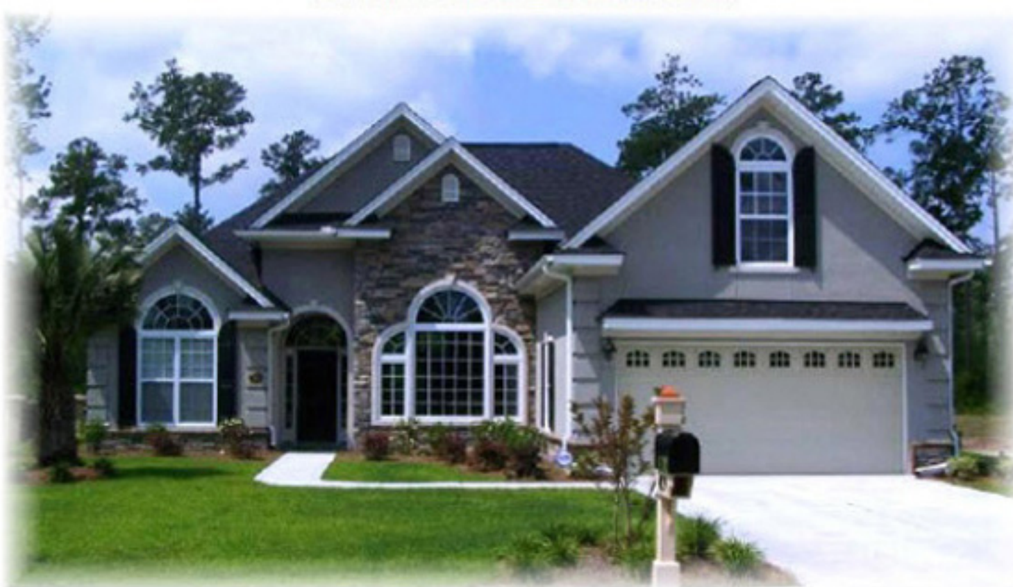
Shown with optional stone and stucco