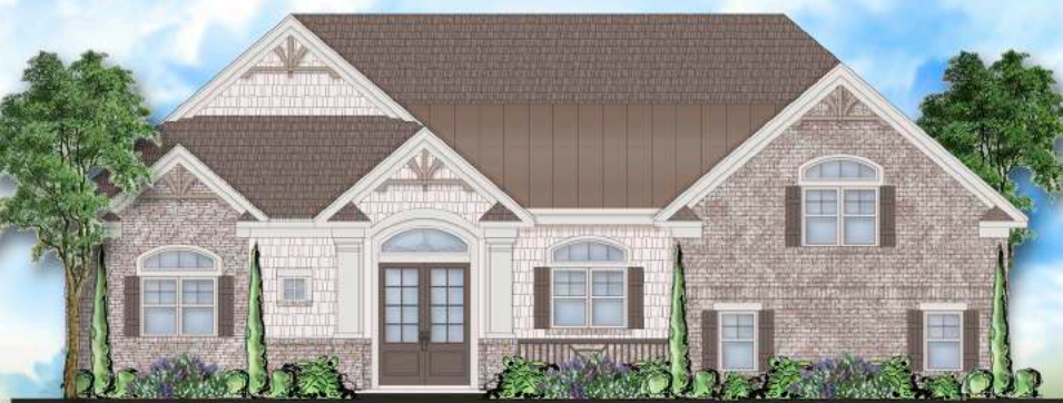
Front Elevation Option A