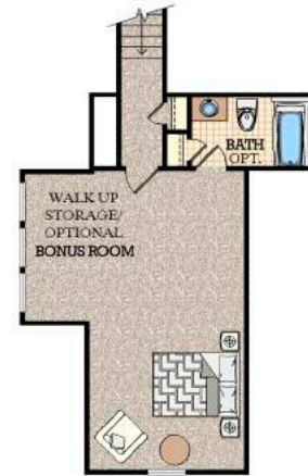
Walk up Storage/ Optional Bonus Room Floor Plan