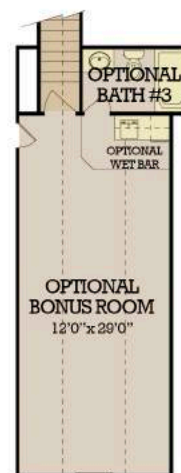
Optional Bonus Room Floor Plan